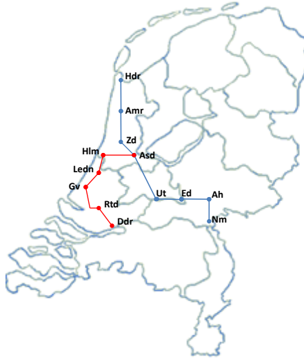
Figure 4: Example lines in the Netherlands